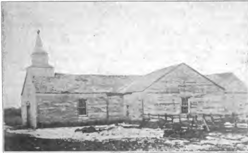
FIRST CATHOLIC CHURCH IN KANSAS.